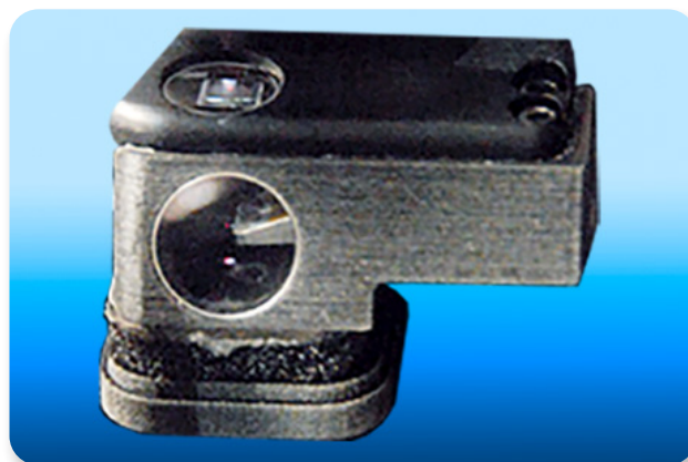
Figure 2. Environmental Control and Heater for nanoIR2 and nanoIR3 systems.